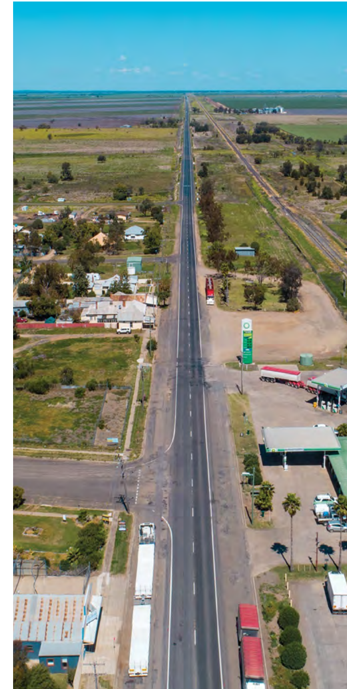
Section 3: Newell Highway looking southbound at Bellata

Fulton Hogan expect to commence work in Section 5 and Section 3 just south of Moree, then working north to south along the alignment from Moree to Narrabri. See the proposed schedule of works to the right.