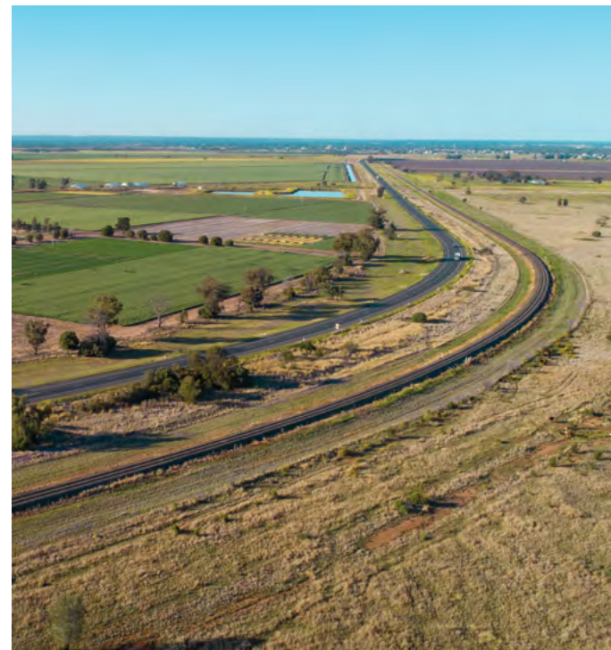
Section 1 looking southbound towards Narrabri