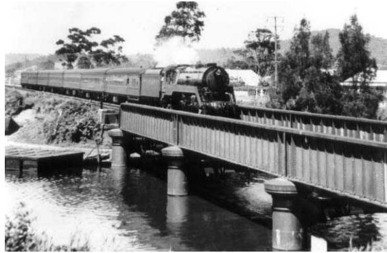
Steam loco and train on half-through girder bridge

As the spans of bridges increased, the metal truss quickly emerged as the ideal structure. The greater the span, the deeper (taller) the side trusses, and very soon through construction from the covered timber bridges became standard. With the inclusion of pinned joints (see photographs of the Nowra Bridge deck in Section 4.7) and the change over from iron to steel around 1880, the large pin-jointed steel truss came to symbolise American bridge technology.