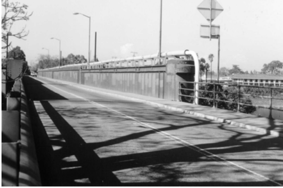
Girder bridge, Penrith