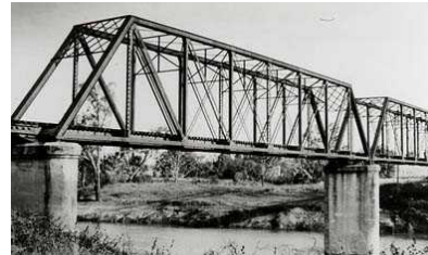
An 1884 sturdy British lattice bridge and the 1901 American Pratt trusses.

Economic quantities of structural steel did not begin to arrive until the 1890's which coincided with the change from British to American bridge technology. The most notable change in the bridges was visual, from the sturdy somewhat heavyweight British lattice