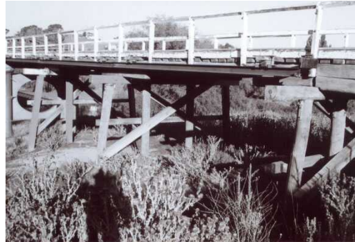
Elevation of timber approach.

However, with low initial costs, timber decks had high long term costs due to their need for replacement approximately every 20 years.