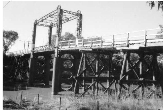
Lift bridge at Brewarrina

An example of the different types of metal bridges.