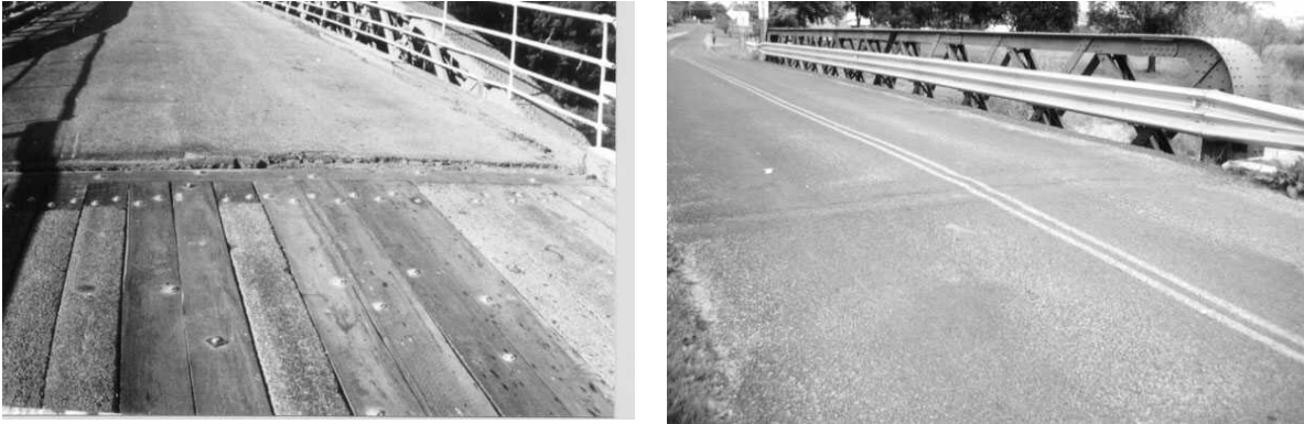
The distinction between rough, exposed timber decks and smooth surfaces provided by buckled plates.

The buckled plate floor has proved to be a cost-effective component of bridge decks and its use, or some variants, has been continued through to modern times even though types of temporary reusable formwork units between beams have been developed. For example, the 1929 Tom Ugly's Bridge has a buckled plate floor with a concrete running surface (refer Section 4.26).