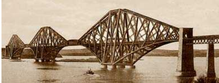
The famous 1890 Forth Bridge, Scotland.

In New South Wales, industrial development, including railways and bridges, took place in the second half of the nineteenth century. The only local iron industry was the Fitzroy Iron Works at Mittagong, started in the 1850s, which only refined cast iron into merchant bars. It did, however, supply the cast iron cylindrical rings for the piers of the 1867 Prince Alfred Bridge at Gundagai. Local cast iron was also used to a limited extent for structural purposes. There are some cast iron floor girders in some old buildings in Sydney's CBD and the King Street Bridge over the railway at Newtown has cast iron beams made in 1892 by Hudson Brothers (Clyde Engineering).