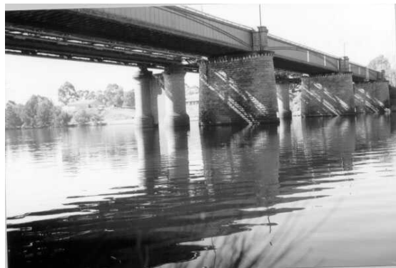
Nepean girder, Penrith