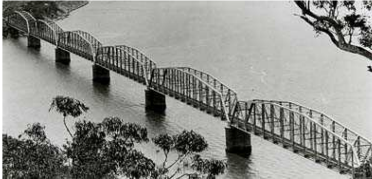
The largest bridge in colonial New South Wales, the American designed Hawkesbury River railway Bridge.

This advantage was first demonstrated on a large scale with the 415 foot (126 metre) steel trusses of the first Hawkesbury River railway Bridge, completed in 1890.