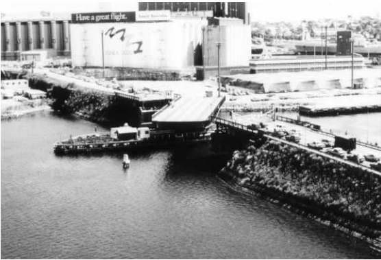
Glebe Island swing bridge