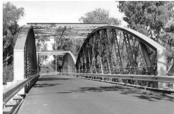
1914 Goodiwindi trusses, axis view

Through bridge construction began with the American covered bridges as early as the 1840s. There were various types of patented timber truss configurations but all were tall enough to be completely enclosed by a protective “skin” of timber boards along the sides plus a roof. The unlit interior really did make driving feel like being inside a tunnel, truly a through bridge.