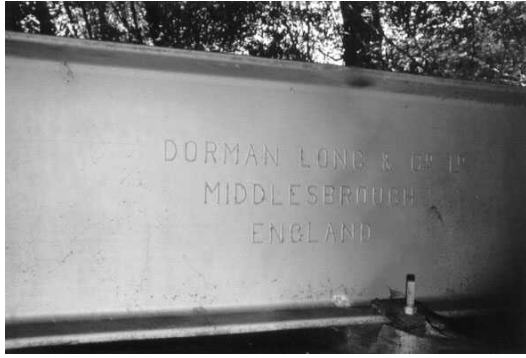
Dorman Long (England)