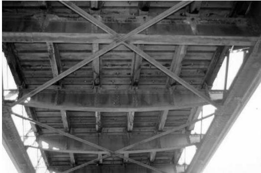
Typical timber beam bridge deck, its log girders and plank deck.

Iron was an expensive import during the colonial period (refer Section 3.5) to the extent that its use was restricted to the main structural components of bridges, that is, the piers of the substructures and the beams and trusses of the superstructures. The usual cost saving device was the use of timber for the approach spans and for the decks.