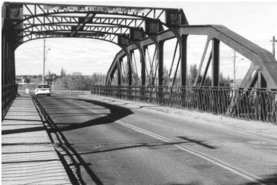
European style half-through bridge with overhead bracing at Bathurst

The development of through trusses was essentially an American innovation. Although some early examples appeared in Britain and Europe, bridges in the Old World were dominated by the half-through bridges, girders and trusses. Even when overhead bracing was used, it was generally applied to a half-through structure as shown in the two photographs below.