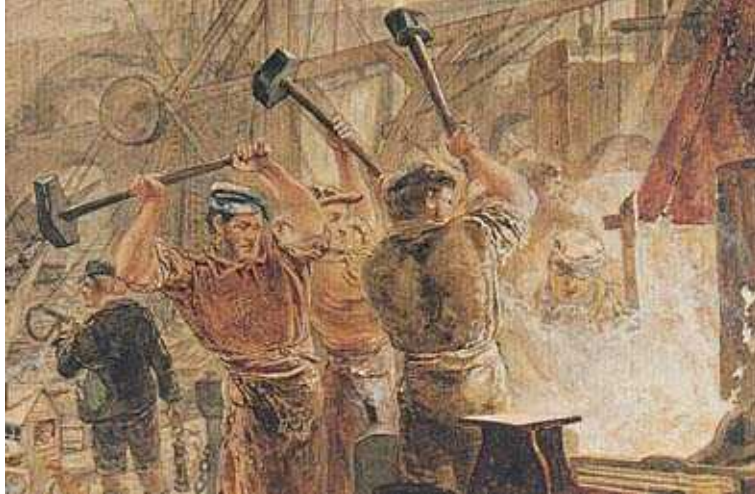
The labour intensive effort of producing wrought iron.

The breakthrough came in 1856 when Henry Bessemer invented his converter, basically an iron pot with holes at the bottom by which air could be blown through a molten mass of cast iron to oxidise the impurities in only about 20 minutes. The resulting pure iron could then be transferred to another furnace where pre-determined amounts of carbon, or any other alloying material, could be added. An economical process for the production of steel had been invented. It led to the mass production of uniformly reliable, low cost steel which was stronger than wrought iron, was equally strong in tension and compression, was malleable, ductile and tough – a wonder material.