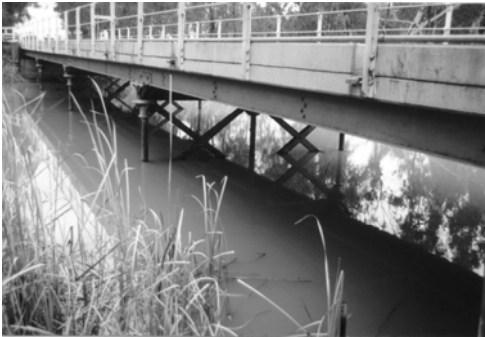
Beam bridge at Oxley