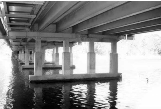
Steel beams at Wallarah Creek