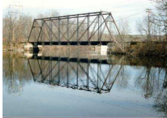
Early American through truss