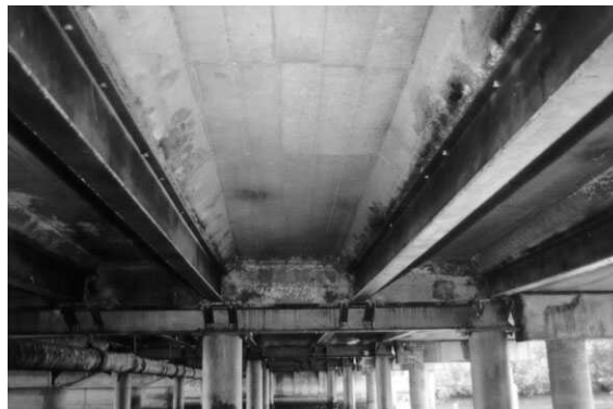
Underside of concrete slab exposed after temporary formwork has been removed.

The buckled plate floor has proved to be a cost-effective component of bridge decks and its use, or some variants, has been continued through to modern times even though types of temporary reusable formwork units between beams have been developed. For example, the 1929 Tom Ugly's Bridge has a buckled plate floor with a concrete running surface (refer Section 4.26).