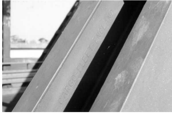
Cargo Fleet (England)