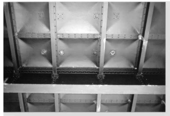
Typical timber deck on a lattice bridge at Forbes and the use of buckled plates

Buckled plates were a form of decking support which provided a rigid connection between beams and cross girders and gave a permanent smooth riding surface. The term 'buckled' is something of a misnomer because it implies collapse whereas the plates were simply dish-shaped and attached, dome upwards, to the tops of the beams or cross girders to form a waffled iron floor. This was then covered with concrete or a similar material to form the road surface.