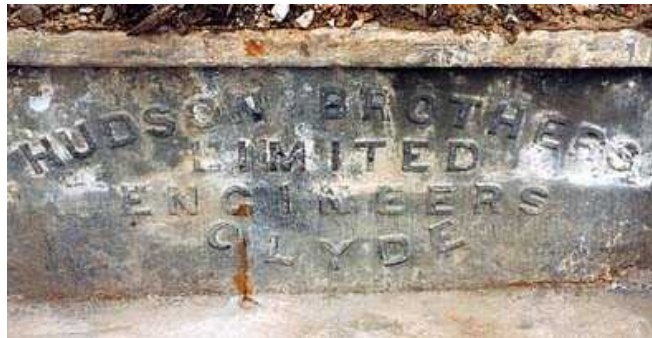
An 1892 cast iron beam at King Street, Newtown and the maker's name.

New South Wales was dependent on wrought iron from England, an expensive import. Despite this, some splendid iron bridges, road and rail, were built between 1873 and 1893, of special note being the lattice truss bridges with spans up to 160 feet (49 metres).