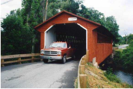
One American enclosed through bridge was the covered timber bridge which became an open spatial arrangement in metal.