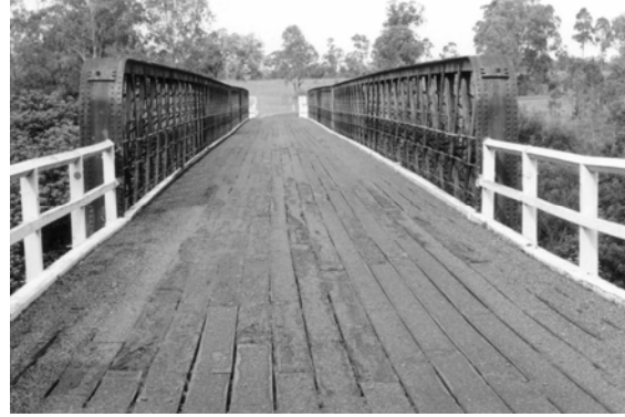
Bawden lattice bridge