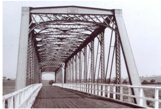
The Luskintyre trusses are a good example of a through bridge.

It is worth noting that for pre-1930 bridges in New South Wales: