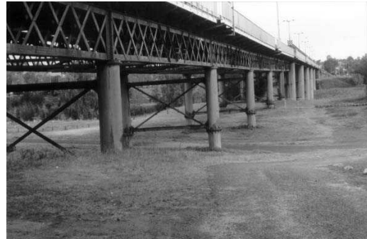
Manilla lattice truss approach

Two examples of deck bridges: beam and lattice truss.