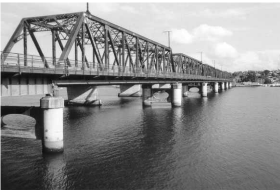
Overhead braced truss