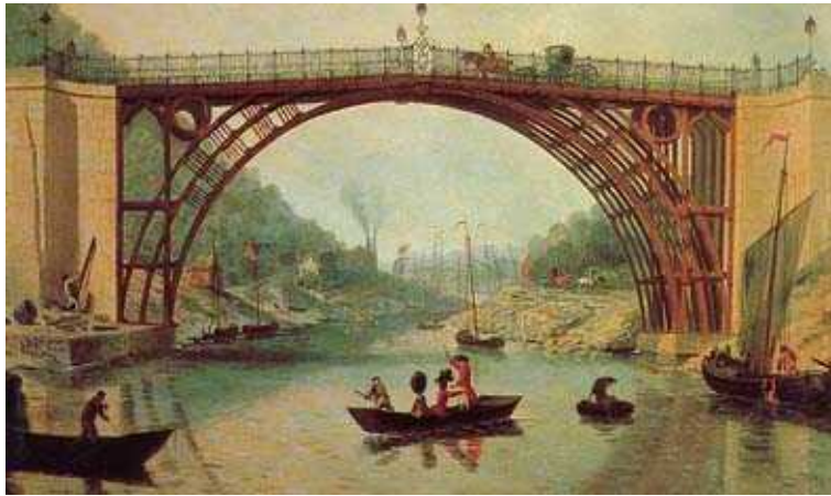
Ironbridge, the first metal bridge over the Severn River, England

The first metal bridge, the 1779 Ironbridge in England, was an open, lightweight arch, a basic compression structure, for which cast iron was ideal and affordable.