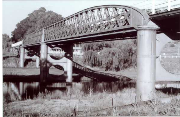
Typical lattice truss