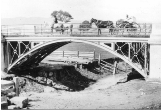
The Albury arch