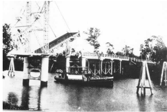
Bascule bridge at Coraki

For example, the most common form of road bridge in colonial New South Wales was the timber beam bridge (Cardno MBK 2000). Based on the availability of high quality local hardwoods, such as ironbark, these bridges were cheap and easy to build. Although their long-term maintenance costs were to prove high, they became the foundation bridge structure for the developing network of roads (and railways) and by 1900 represented 87% of the road bridge population (PWD Annual Reports). Timber truss bridges, in contrast, comprised approximately 10%.