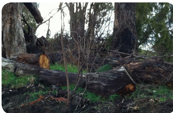
Illegal firewood collection is a problem in some roadside reserves

The impacts of these issues may vary from place to place. For example, along isolated roads littering may be non-existent; along roads leading out of cities and regional centres it may be a significant management issue. Management strategies for such issues should be considered in the development of the RVMP.